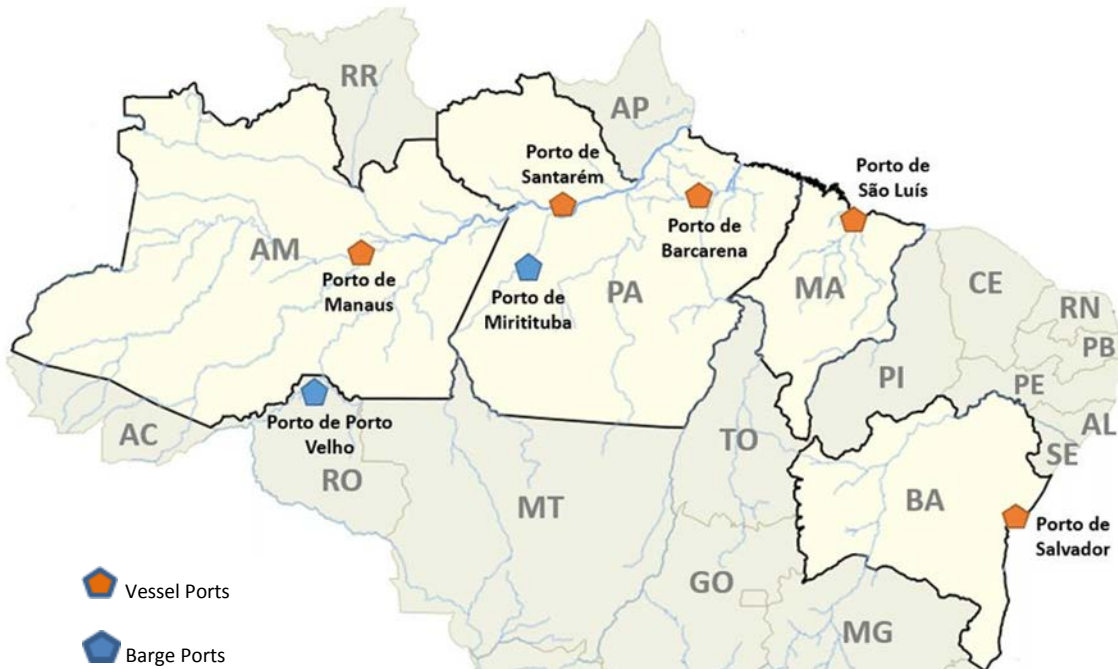
Figure 2 - Northern Arc Ports